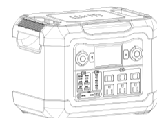
Portable Outdoor Mobile Power Station OPS1200